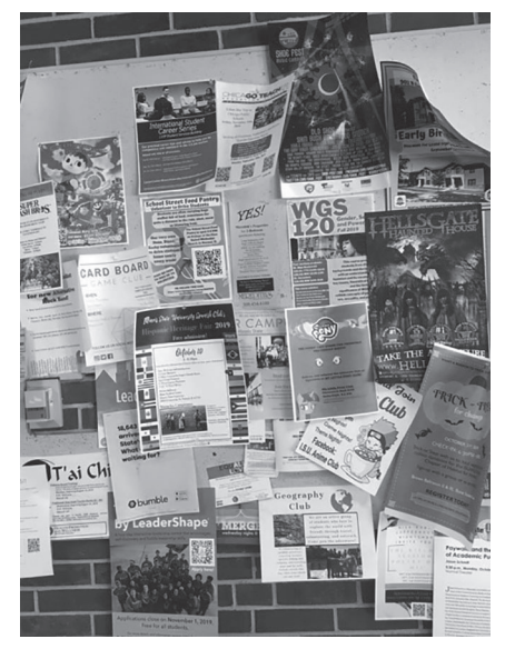
Figure 1: Stevenson Hall bulletin board.

trying to convince you of something. This is obvious with an advertisement (i.e., whatever is being advertised can fill a need you have), but less so with news articles, which on the surface can be seen as informative rather than persuasive. However, there are distinct choices involved in the production of a news article that inform your interpretation of the content. With a careful analysis, the connection between the genre's characteristics (terminology, visuals, content, distribution choices, etc.) and its goals (to inform or persuade—or both) can become more clear, and this sort of investigation can help us understand how these genres work to shape the thinking and/or behavior of their target audience.