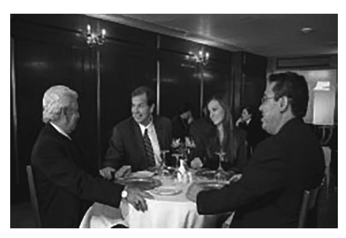
Figure 2: Business meetings in Mexico are usually in restaurants; portraying culture difference.

customs and traditions. Cultural customs and traditions in international negotiations are essential to achieve the stated objectives. What is functional in one culture may not be so in another. In Mexico, when you are going to close a business deal with someone it is usual to give your partner and expensive gift as a symbol of loyalty; however, in the US that can be taken as a rude act. The idea that language use is essentially social also underlies current work in literary theory and sociolinguistics. This makes the P-CHAT concept of ecology very important, because ecology focuses on how texts and humans and tools work together in the material world. Ecology enriches our environment and is important to the well-being and welfare of humanity. It offers new awareness of the interdependence between people and nature, which is vital. It is important to consider the cultural differences between the countries that intend to commercialize or establish an agreement. Such differences help to identify the preferences of potential consumers, as well as to identify their different needs. Because business differs in every country, people might approve of your business model or you as a partner depending on the way you act, and if they can truly trust you. This is why cultural differences require a different approach.