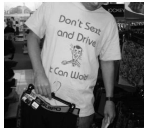
Figure 2: Will these undies be sexting friendly?

I fancied my shirt's message to be a mildly clever play on the recent, widespread public service announcements about the dangers of texting while at the wheel. The message also has some additional currency with recent high profile sexting scandals (a politician named Anthony Weiner sending women photos of his junk? It's just too perfect). Just the notion of some idiot trying to sext while driving is humorous to me. I suppose there are morons out there who have attempted it, and I can't imagine it's very easy to keep one hand on the wheel while keeping your camera phone steady, and . . . well, you get the idea. So, this shirt would also function as a public service, helping prevent imbeciles from driving into oncoming traffic while Snapchatting pics of their unmentionables.