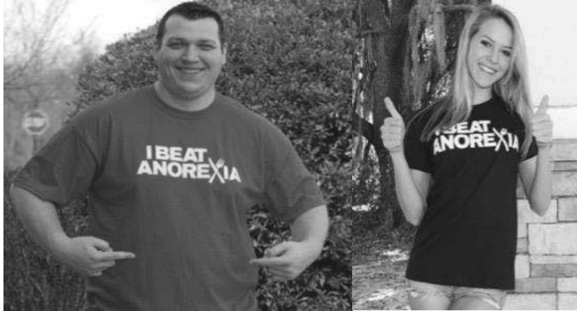
Figure 1: The message differs according to who is wearing it.

humor is dependent on the wearer. Consider the following shirt advertised on badideatshirts.com (Figure 1). The words are the same, but how could their messages be interpreted differently based on who's wearing the shirt?