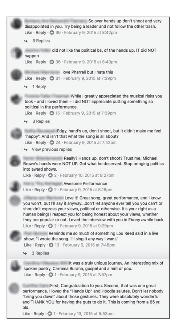
Image 3: The comments on Pharrell Williams's public Facebook status about his 2015 Grammy performance.

Now let's consider the distribution of this performance. Distribution is focused on where texts go and who might take them up (isuwriting.com). The intended audience is the people sitting at the venue, as well as viewers watching the performance live. An author can't always control how their