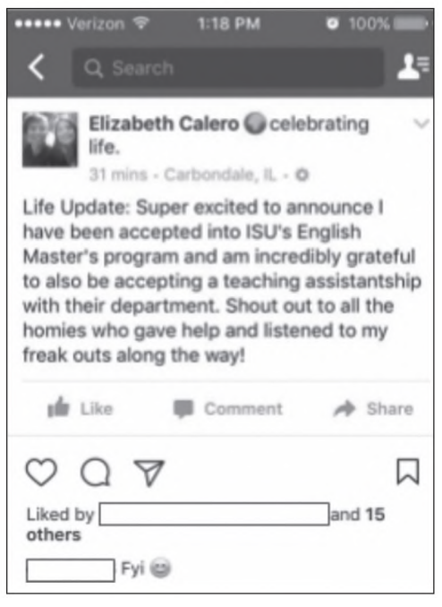
Figure 5: ISU Announcement post.

"ISU Announcement," which featured a screenshot of my Facebook post about my acceptance to ISU with a caption of "FYI" and an emoji smiley face, was given a total of seventeen likes and three comments from my followers. It was a post created out of joy and excitement at my accomplishment and what it meant for my future. Two of the comments were from the same user, and the first comment did try to match my emotional high with a "yessss" followed by several emoji hearts. This elongated yes, along with the emoji love, can be read in such a way that it matched the celebratory nature of my post. This single word is the best indicator that my emotional representation was received by my audience. The second comment was a simple response to a