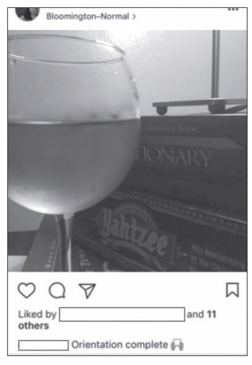
Figure 6: Orientation Complete post.