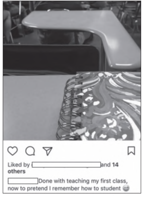
Figure 7: How to Student post.

question I had asked. The second user to respond did not leave a comment of a celebratory nature, but one of solidarity. They just wanted to let me know they lived in the area and that my move would make hanging out in person much easier.