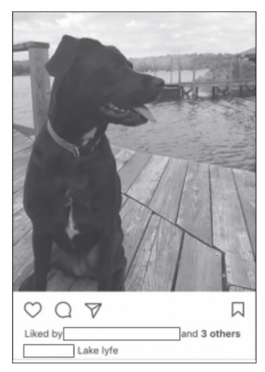
Figure 4: Pet post.

of my food posts are created when I eat food with other people. Eating food and being with people makes me happy enough that I want to share and celebrate that with my followers. The captions reinforce this celebration with words and phrases like, "Out here livin my best life ya'll" under a close up of a cupcake, "Heaven" under an ice cream sandwich, and "Reasons to come home" under the spread at a family cookout.