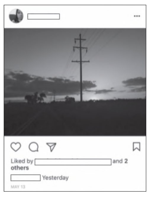
Figure 3: Landscape post.

Food seems to be motivated by a feeling of celebration or joy. I love food. It makes me happy, simple as that. Food posts can also be connected to a kind of celebration of companionship. Most