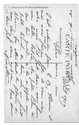
Figure 1: An example of a historical card showing World War I propaganda, found via online collectibles store Vicmart at www.vicmart.com/i-2638-wwi-france-anti-german-propaganda-postcard.html.

a specific event or holiday. These postcards used to be sent for every holiday, but as demand died down, selection has become limited mostly to postcards for major holidays and birthdays. However, some people may choose to use any postcard as a greeting card by writing a sentimental message like "Happy Birthday" or "Get well soon" on the postcard, while still indicating from where they are writing. Historical cards focus mainly on events and social norms. If you were to find a postcard with war propaganda on the front (Figure 1), it would be an example of a historical