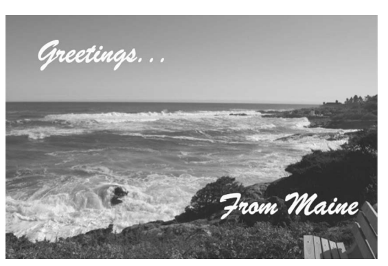
Figure 3: The front of the postcard I created.

I decided to create my own postcard (Figure 3) to further understand the process of making one, which meant I had to do more research in order to create a genre that I had never created before. I have sent postcards to my friends, so