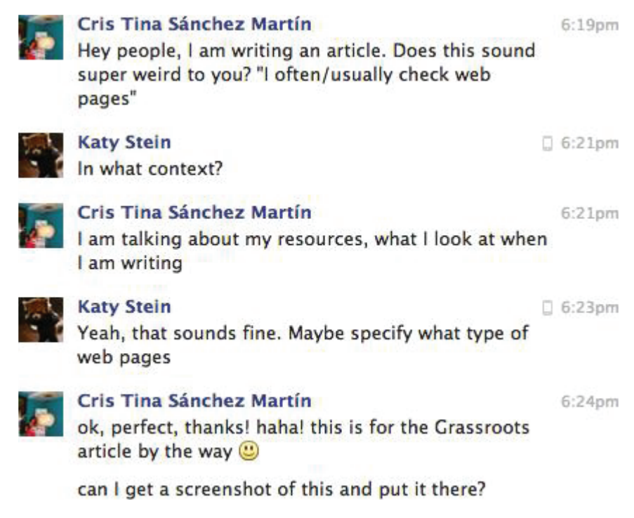
Figure 2: I Facebook My Friends To Ask Them About My Word Choices