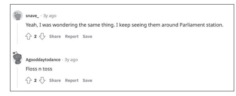
Figure 4: Other users in the community are agreeing with the original post made about seeing an abundance of floss picks (@CanuckAussicKev).

that writers can use when they are composing. Flossed in America cannot only be shared via Twitter; it can also be distributed through other means of social media like Reddit and Instagram. The more multimedia composing that is done, the more the text can be distributed and influence others.