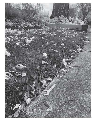
Figure 1: Floss found in Crystal Lake, IL by Dan Ebert (@TossedFloss).

a gallery of stories depicting what would otherwise be deemed meaningless trash. The ISU Writing Program defines a discourse community as "a grouping of people who share certain language using norms and practices." My aunt and uncle had noticed the trend of floss picks on the ground and began sharing their findings with others, documenting each floss pick they found with a photo. An example of these findings can be seen in Figure 1, as well as in the other images I've scattered, like forgotten floss picks, throughout this article. This eventually led to the creation of the Flossed in America Twitter profile, which is known on Twitter as @TossedFloss. Conveniently, the name doubles as a username for the social media profile and the name for its discourse community. Below is the origin story in my uncle's own words via a phone interview.