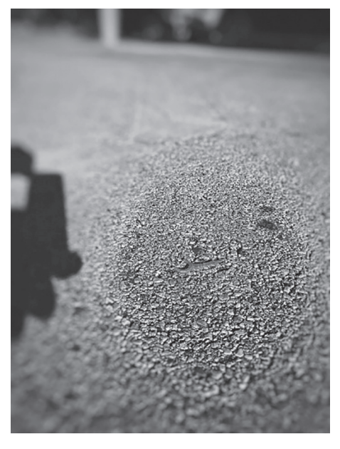
Figure 3: Floss found in Vernon Hills, IL by Dave Ebert (@debert26).

P-CHAT later, but for now, I would like to focus on its specific discourse community and how socialization is at play for the development of the profile. The socialization and re-creation methods are the foundation for this community to thrive and grow. When people have been introduced to the idea of commonly discarded floss picks, they will be more inclined to look for them. Once they do find them, the participation process is easy enough to motivate people to post and further socialize with the movement. The key activity that marks someone joining this community would be for a person to snap a photo of the floss pick, add a location to the photo, and perhaps make further comments. This is the primary activity through which the discourse community continues to grow. This idea is not specific to the Tossed Floss