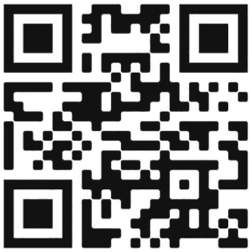
Figure 2: Link to Case File podcast.