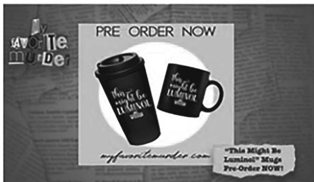
Figure 11: MFM merchandise “This might be Luminol” mugs found on My Favorite Murder website.