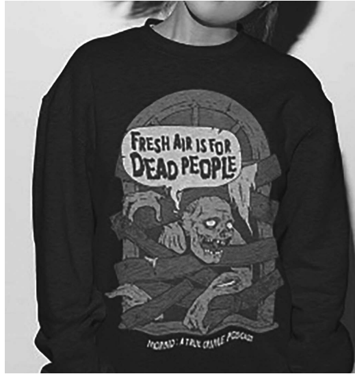
Figure 13: Morbid: A True Crime Podcast merchandise sweatshirt.