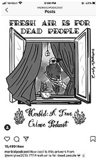
Figure 12: Morbid: A True Crime Podcast fan art on Instagram by @Emilyrae2015.