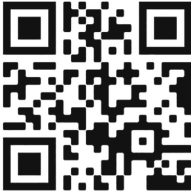
Figure 1: Link to My Favorite Murder (MFM) .

most depraved parts of humanity. When I choose a podcast, I look for hosts and production teams sensitive to victims' legacies and families, and that handle the complexities of trauma and mental health with care.