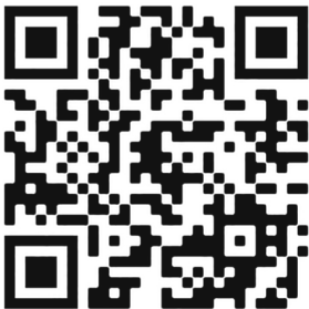
Figure 3: Link to Crime Junkie .

There are many ethical True Crime podcasts that exist with different stylistic approaches. For instance, an Australian True Crime podcast called Case File is dramatically different from MFM because instead of having a dialogic storytelling conversation, this podcast relies on a scripted narrative by one host. Case File takes on a more serious tone by focusing on narrative reports and facts found within original public or police documents, and excludes any personal information or anecdotes about the host. Crime Junkie is another podcast that exists between MFM and Case File 's stylistic extremes. The host, Ashley Flowers, reports facts on cases while having her co-host Brit Prawat act as a commentator on those cases. Crime Junkie includes personal anecdotes and has a dialogic and improvised feel like MFM , but also follows a closely scripted narrative that isn’t necessarily comedic. No matter what style a True Crime podcast uses, the subject discussed moves beyond entertainment by interacting with the real-world crimes.