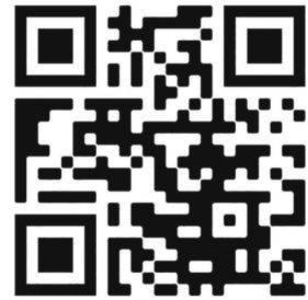
Figure 4: Link to “Murderpedia.”

Production encompasses the tools and practices that go into creating a text. In every podcast I listen to, the hosts mention where they have gotten their source material from. For instance, MFEM often jokes about their use of Murderpedia. The interactive site allows users to research particular cases and perpetrators to often find pictures and case details. The website, great for initial case exploration, is just the tip of the iceberg for the research that goes into compiling and producing an informative podcast episode. Often, hosts will mention documentaries, movies, books, news articles that they pull from as source material. For instance, the episode: “Infamous: The Dexter Killer” pulls from the nonfiction book, The Devil’s Cinema: The Untold Story Behind Mark Twitchell’s Kill Room , CBC News articles, the Edmonton Journal , various YouTube videos, and primary documents. Not only are these informative podcasts multimodal production pieces, but sometimes, cases covered in a True Crime podcast can inspire further multimodal trajectories after its aired, such as a docuseries or an art exhibit. The podcast Serial gained so much attention