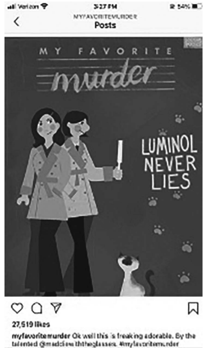
Figure 10: MFM fan art on Instagram by @Maddiewiththeglasses.

Not only has the reception of many True Crime podcasts’ quotes moved beyond the original intention of reporting on a case, but the way