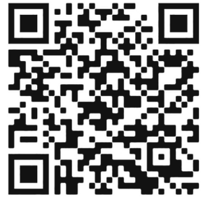
Figure 17: Crime Junkie podcast.

I, for one, would have never heard of these cases if not for Crime Junkie's episode detailing these cases. The attention garnered for the Highway of Tears through familial efforts and podcasts has created enough public outcry in multiple cultures and communities for the provincial government to improve safety along the highway, such as funding traffic cameras and vehicles for Indigenous communities.