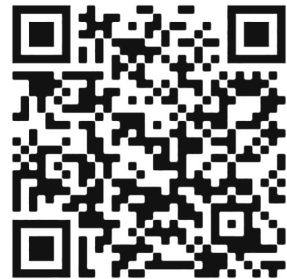
Figure 5: Link to “Infamous: The Dexter Killer.”