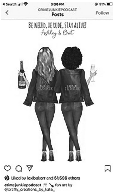
Figure 15: Crime Junkie fan art on Instagram by @Crafty_creations_by_kate_.