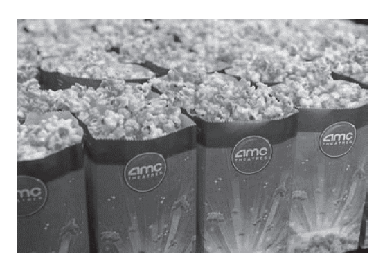
Figure 3: A fleet of large popcorn bags from AMC

I will start with the last genre because it seems like the most unlikely genre to impact someone's decision to buy anything. This is, however, the most basic selling concept of a movie theater. Think about the last time you went to a movie theater. Do you remember the smell of freshly popped popcorn when you entered the lobby? That is because concession employees pop a new batch of popcorn at the beginning of each set. This smell is of vital importance to the