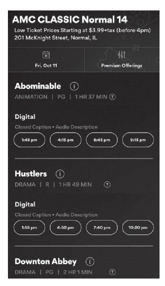
Figure 1: A screenshot of showtimes on my AMC Theatres app

So, it's Friday night and you want to watch a movie. How do you decide which movie to see? Part of this decision rests on how often a person watches movies at the theater. For me, I often know which movies are coming out each week because I watch a lot of trailers on several platforms. The genre of trailers is important to my process because they are short clips—usually between one-and-a-half or two-and-a-half minutes—that give the audience an overview of what the movie will be about. However, there are many genres that can help people decide what to watch, many of which are based on the time the movie starts. Because the movie theater is an activity system that is always changing, the genres surrounding it are also changing.