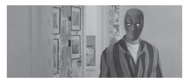
Figure 5: The final end credit scene from Deadpool.

to see. This tongue-in-cheek end credit scene was the beginning of a slow change in how Hollywood produces their films and how audiences receive them.