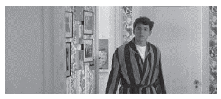
Figure 4: The final end credit scene from Ferris Bueller's Day Off.