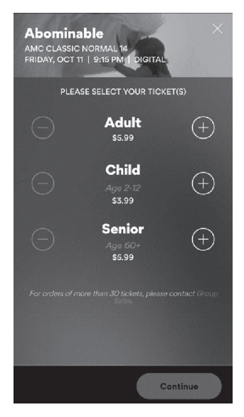
Figure 2: The ticket prices for a matinee showing of Abominable .

In recent years, AMC has introduced two new ways to buy tickets without going to the box office. Knowing that patrons do not like standing in those long, opening-night lines, AMC began opening sales on their website