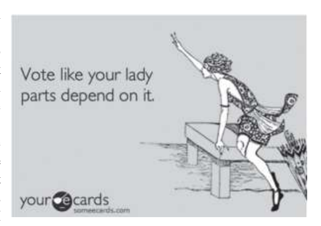
Figure 1. An image I liked and shared on Facebook ("Vote").

I've never met the person who originally posted this image. Most who had also belonged to this Facebook group (meaning they had liked this group sometime in the past and had not un-liked this group since that decisive digital move) and who were moved to respond to this post in some way gave rave reviews and favorable comments. I liked it so much I shared it on my wall. About an hour later, one of my friends posted the