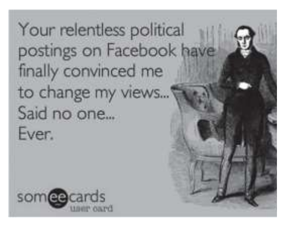
Figure 4. Another image that criticizes political Facebook posts and posting ("Your relentless political postings").

On the other hand, Planned Parenthood has 343,538 likes. So there are people like me out there. That's comforting. But maybe they are all doing it wrong, like me. And maybe these Planned Parenthood people don't like reading other kinds of political posts. Or maybe some of them don't think Planned Parenthood is political.