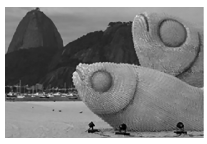
Figure 3: An example of a sculpture made of plastic bottles.

Now, I do not intend to discourage readers from recycling, but I believe it is important to mention that even if you do dispose of recyclables properly, it is still possible for the end products to end up in the natural environment. This is because recycling centers can be classified as either an open-loop or closed-loop system. If a center is an open-loop system, it means that the items being recycled can be turned into completely new items such as polyester. This type of recycling can sometimes still be bad for the environment because many of the new items made from recycled materials end up in landfills. A closed-loop system means that the items that go through the center are remade into new plastic bottles and containers. This can also be called bottle-to-bottle recycling and is the better option when it comes to recycling. Furthermore, the best option when it comes to recycling. Furthermore, the best option when it comes to recycling would be to REDUCE the number of plastic products you purchase altogether. Before buying plastic, at least take a moment to consider alternatives or whether you need the product in the first place.