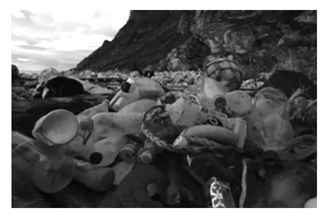
Figure 2: Plastic marine waste accumulated on a beach in Troms, Northern Norway.

Now, sometimes I wonder how it feels to be a CEO of a big plastic producing company such as Coca-Cola. What do they think about their environmental impacts? Do they care at all, or are they simply concerned with the revenue they will bring in? These types of questions help to discover the company's representation , or how the creator of the text thinks about their product. For example, since the news got out that plastic is harmful to the planet, some water bottle companies attempted to reduce the amount of plastic used to make each bottle. However, these companies have no intention of halting plastic production altogether. I could argue that the representation of these companies is careless, stubborn, and money hungry.