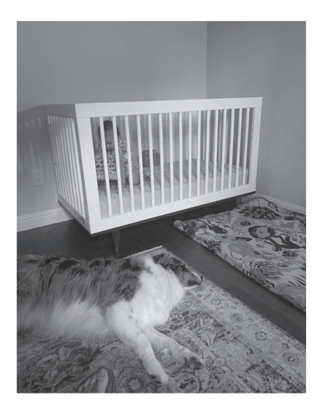
Figure 1: My pandemic writing views have changed drastically over the past year. Being the primary caretaker for my daughter, I often write in short bursts, usually from her nursery rocking chair.

PLA Narrative: I used to be able to spend seven-to-eight hour stretches of time writing for classes, answering emails, and reading for my research. Since the pandemic, I've been the sole caretaker for my daughter and much of my day is spent caring for her. Now, I'm lucky if I can find fifteen-to-twenty minutes of uninterrupted time to work. This is the plight of many parents and caretakers in the pandemic who now find their writing/work time after their little ones go to bed. I've also found that the physical spaces I write in have drastically changed. I now often write on the floor of my kid's nursery, constantly pulling my laptop cord out of her hands and moving my phone/laptop out of her reach. I've noticed that it even takes a physical toll on my body, as her rocking chair that I often occupy isn't exactly ergonomic.