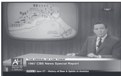
Figure 1: This is a screenshot of a 1967 CBS Television News Report giving updates on the Vietnam War for the American public (“The Ordeal of Con Thien”).

Up until 1965 and the Vietnam War, most American citizens had never seen the reality of combat. Throughout World Wars I and II, newspapers, articles, and eventually newsreels—that came many days and weeks after the events they were covering—were the only way noncombatants received information about wars. With the invention and increase in availability of televisions to the average citizen around the time of the Vietnam War (Figure 1), however, this all changed, and Americans would never think of or respond to war in the same ways they had in the past.