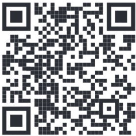
Figure 2: For more information about the Tet Offensive, check out this resource from the Office of the Historian (“US Involvement in the Vietnam War”).

There is still a lot of debate about the impact that American news coverage of the Vietnam War had on the way Americans perceived the war, and even on the way policies related to the war were decided. But one thing that we know is true is that television coverage of the war, which often included “live” broadcasts from combat zones and was less firmly controlled by the government than media coverage in World War II (such as newsreels), was an entirely different genre. The immediacy and the visceral quality of TV war coverage was certainly different, even if the impact of that difference is disputed (Huebner 150; Kratz).