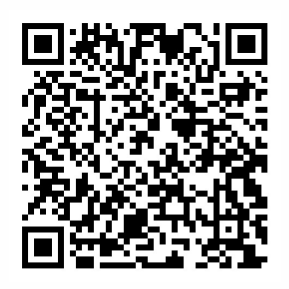
Figure 6: This QR code leads to a TikTok about the Netflix series Bridgerton .

views and only seventy-eight likes which is pretty low for me. The day after season two of Bridgerton came out, I quickly made a video in my car as I waited to go into work about how I related to the characters of Kate and Anthony. This video that was not sponsored and that was made in about five minutes currently has 64.3k views and 6.9k likes (Figure 6). If this doesn't show how viewers value personal opinions rather than sponsored ones, I don't know what will. This is a clear example of the consumers themselves rejecting the commodification of BookTok. They see when someone is paid for a post or sent free stuff, and from that fact alone, they don't