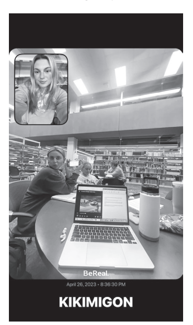
Figure 2: A BeReal photo of my friends and me studying at the library.

I certainly had reservations about joining yet another social media platform and one that required me to show my face in one way or another. This was the prior, antecedent knowledge that I took with me as I downloaded an app I had never interacted with before. I first learned about antecedent knowledge in my 101 class when we discussed that prior knowledge isn't always helpful; it can hold you back, cloud your judgment, or give you false information about new things. I realized that was the case