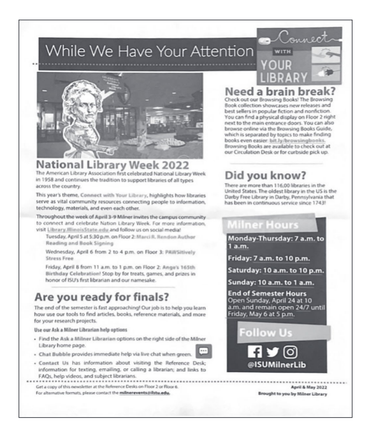
Figure 3: A flyer made by Milner Library advertising some of their programming.

all kinds of different activities around here. When thinking of libraries, "multimodal" may not be the first word to come to mind. Many people tend to think that libraries are just for books, but step into Milner Library on nearly any day of the week, and you will see a testament to the multimodality of libraries today. Someone at a nearby table is eating lunch. There are lots of people typing on their computers. My friends are next to me playing a board game they brought, and another group across the room is playing hangman on one of the whiteboards. Loads of people are talking, but I genuinely don't see anyone reading. And this is just my line of sight on one floor out of six! I actually can't even see a bookshelf from where I'm sitting, although I know they're there. So, while the stereotype of librarians hovering over patrons saying, "Shush, read your book!" may have been the case at one point, it clearly isn't now. Multimodality makes use of all the different forms of communication that people are capable of (ISU Writing Program), and it is engrained in libraries today to the point that the idea of a library with only books seems extremely outdated. If we think back to the goals of the people who were instrumental in developing libraries to "promote the public good" ("Public Libraries in North America"), we can still fit these activities