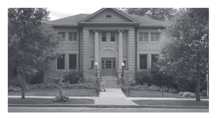
Figure 1: A picture of my childhood library, found on the library's Facebook page.

lighting for our library. It was this plan for expanding my childhood public library that made me start thinking about libraries as activity systems and how those activity systems are changing over time.