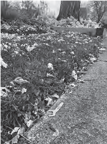
Figure 1: Floss found in Crystal Lake, IL by Dan Ebert (@TossedFloss).

a gallery of stories depicting what would otherwise be deemed meaningless trash. The ISU Writing Program defines a discourse community as “a grouping of people who share certain language using norms and practices.” My aunt and uncle had noticed the trend of floss picks on the ground and began sharing their findings with others, documenting each floss pick they found with a photo. An example of these findings can be seen in Figure 1, as well as in the other images I’ve scattered, like forgotten floss picks, throughout this article. This eventually led to the creation of the Flossed in America Twitter profile, which is known on Twitter as @TossedFloss. Conveniently, the name doubles as a username for the social media profile and the name for its discourse community. Below is the origin story in my uncle’s own words via a phone interview.