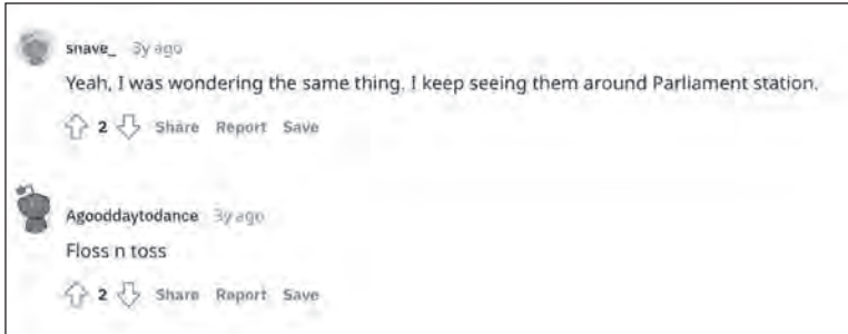
Figure 4: Other users in the community are agreeing with the original post made about seeing an abundance of floss picks (@CanuckAussieKev).

that writers can use when they are composing. Flossed in America cannot only be shared via Twitter; it can also be distributed through other means of social media like Reddit and Instagram. The more multimedia composing that is done, the more the text can be distributed and influence others.