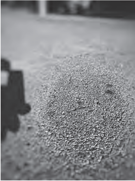
Figure 3: Floss found in Vernon Hills, IL by Dave Ebert (@debert26).

P-CHAT later, but for now, I would like to focus on its specific discourse community and how socialization is at play for the development of the profile. The socialization and re-creation methods are the foundation for this community to thrive and grow. When people have been introduced to the idea of commonly discarded floss picks, they will be more inclined to look for them. Once they do find them, the participation process is easy enough to motivate people to post and further socialize with the movement. The key activity that marks someone joining this community would be for a person to snap a photo of the floss pick, add a location to the photo, and perhaps make further comments. This is the primary activity through which the discourse community continues to grow. This idea is not specific to the Tossed Floss